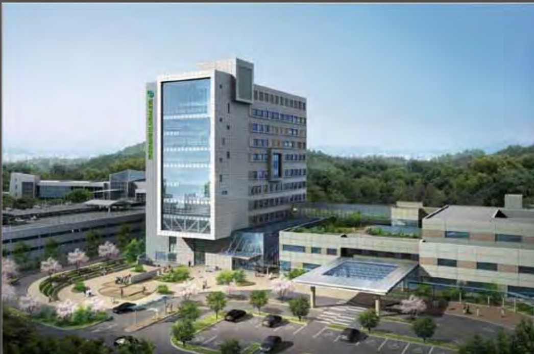
Chungcheong Regional Center for Respiratory Disease

Chungbuk National University Hospital 776, 1 Sunhuanro, Heungduk-gu, Cheongju-city, Chungbuk, South Korea